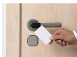
Aperio H100 handles Slim battery powered multi award winning handle