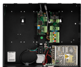
Incedo EAC-M50 metal enclosure unit Set up is easy for simple expansion