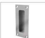
Rectangle Flush Pull (400) SAA, also available in stainless steel