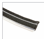
Track Seal (BS10B) black