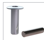
Fantom Magnetic Door Stop (FANTOM/S) for swing doors

View our full range of accessories on page 136