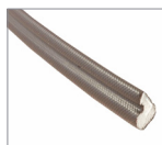
Door Perimeter Seal (AQ63B) brown, also available in white