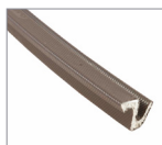
Frame Perimeter Seal (AQ21B) brown, also available in white