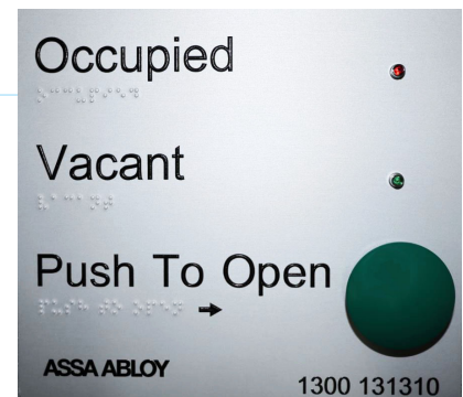
Internal Switch / Braille Plate