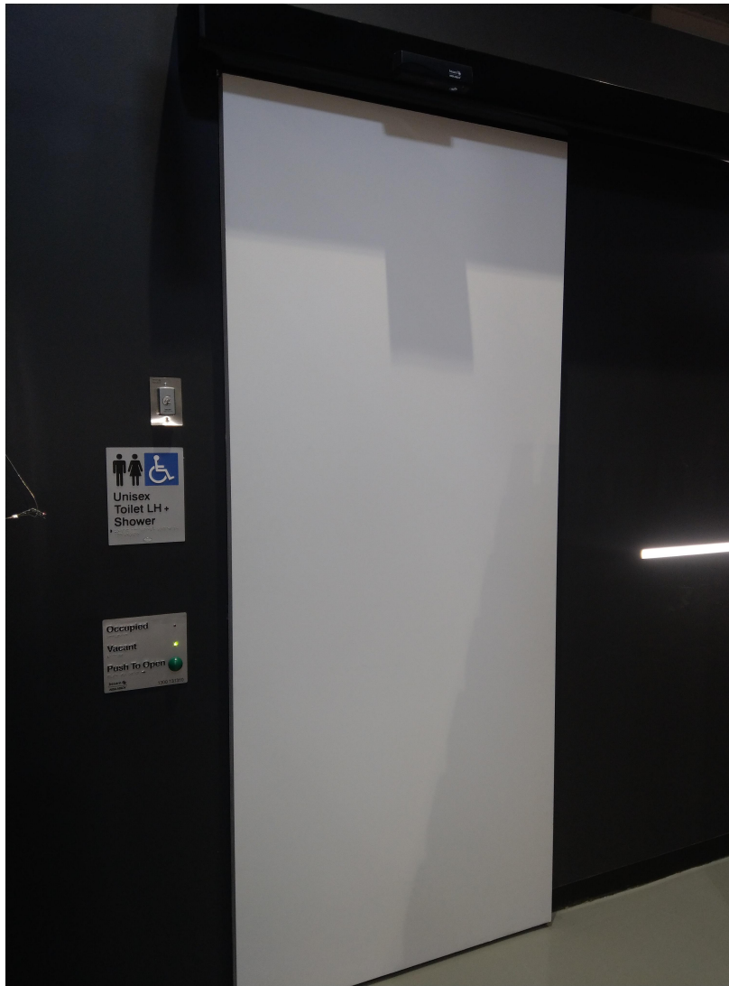
External Switch / Braille Plate