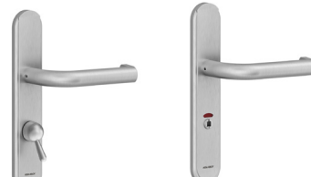
Bathroom - Indicator + Emergency release