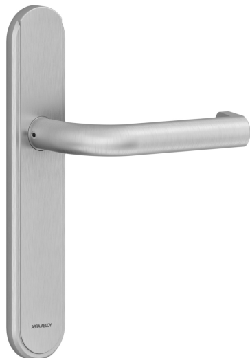
Door furniture on plate U shape lever