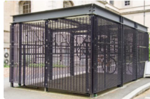
Gates and outdoor containers