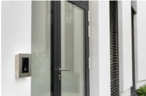
Interior and exterior doors

With CLIQ, one programmable key can operate almost any access point. More than 60 cylinder and padlock variants ensure a perfect fit for indoor, outdoor, and harsh environments – including critical infrastructure.