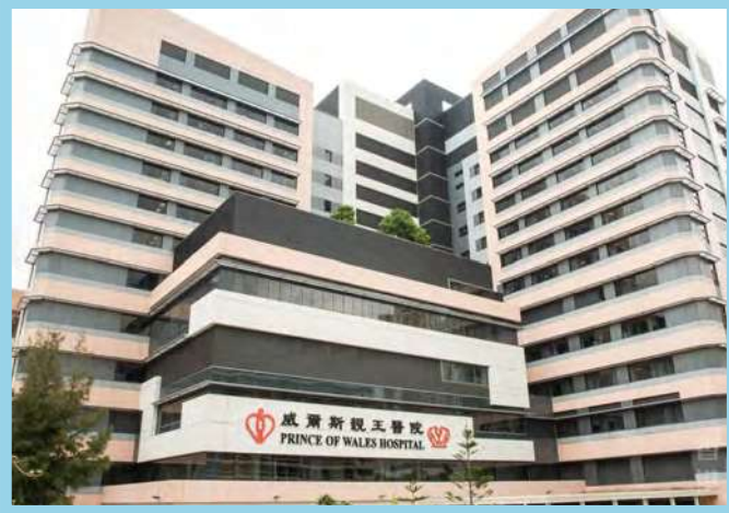
Prince of Wales Hospital