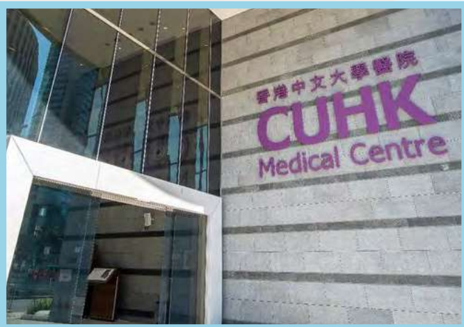
CUHK Medical Centre