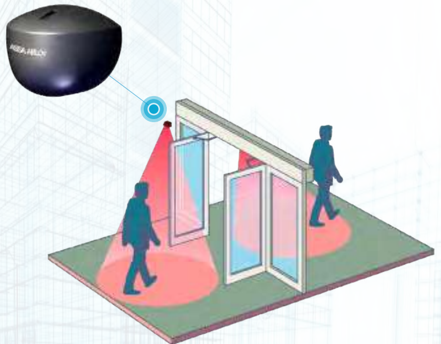
ASSA ABLOY Activation Sensor