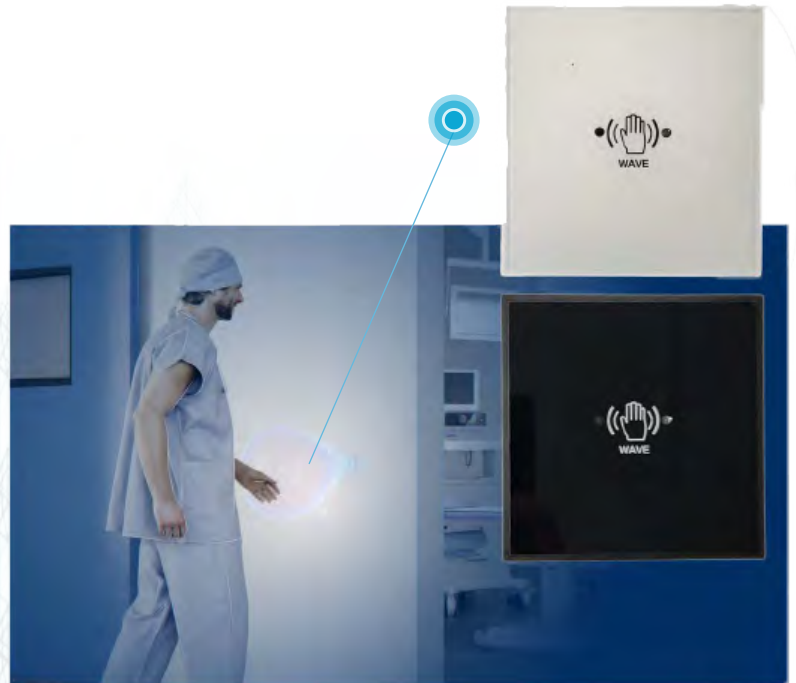
ASSA ABLOY HYGIENE contactless sensor-switch

We offer the industry's most complete, flexible service solutions, including regular safety, compliance and quality control checks. And our local certified technicians respond quickly to any issues to ensure that your doors, no matter the brand, are fully operational, and downtime is kept to a minimum.