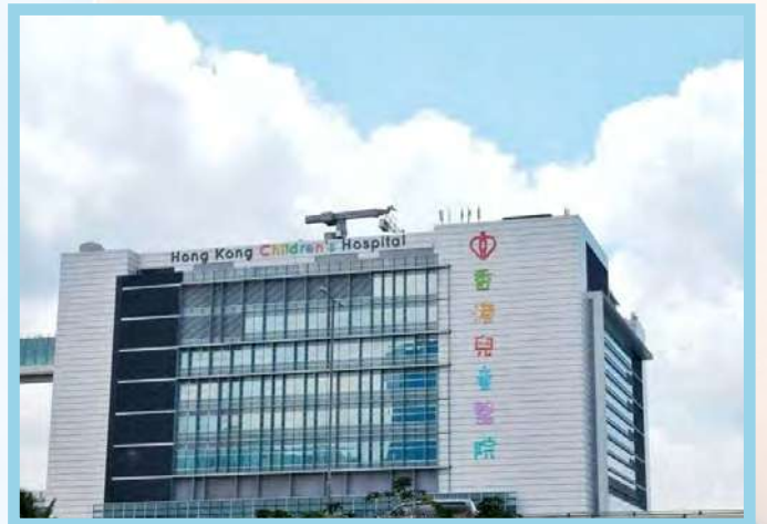
Hong Kong Children's Hospital