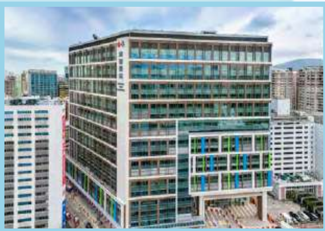
TWGHs Kwong Wah Hospital