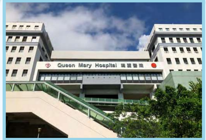
Queen Mary Hospital