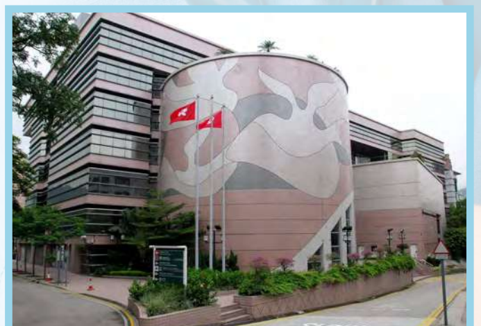
Hong Kong Hospital Authority Head Office