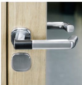
Aperio H100: The award-winning H100 fits access control inside a slimline door handle

In addition to streamlining their working environment, Canal+ takes particular care to green interior and exterior spaces – as well as to indoor air quality and exposure to natural light – in order to reduce the building's energy consumption.