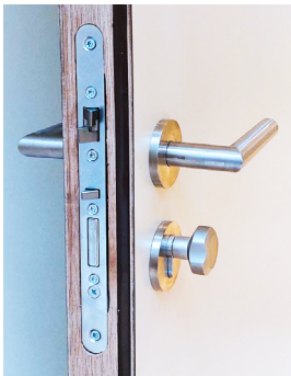
Abloy locks add an extra level of security to external doors