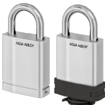
Optional: Dust cover

A trusted, robust padlock for multiple applications. Secure almost anything with the CY110 padlock, inside or outdoors. Suitable for sheds, gates, fences, lockers, storage boxes, bike chains, and more.