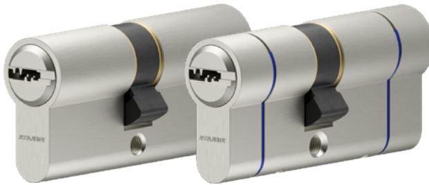
Optional: Anti-snap cylinder

Durable and secure, the CY100 double cylinder provides the protection you need to lock your building's doors – inside or out.