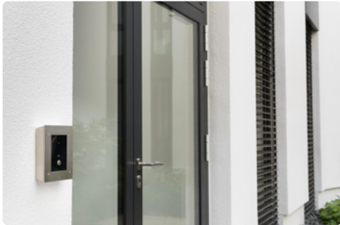
Interior and exterior doors

With CLIQ, one programmable key can operate almost any access point. More than 60 cylinder and padlock variants ensure a perfect fit for indoor, outdoor, and harsh environments – including critical infrastructure.