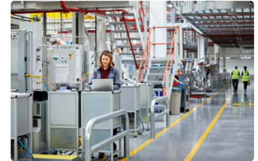
Machines and control panels