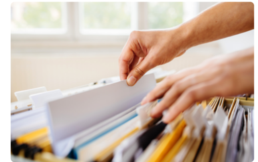
Cabinets and lockers