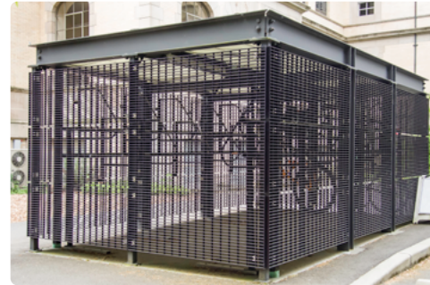
Gates and outdoor containers